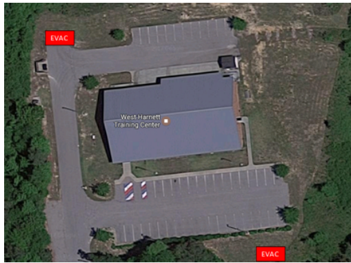
West Harnett Training Center (0060)