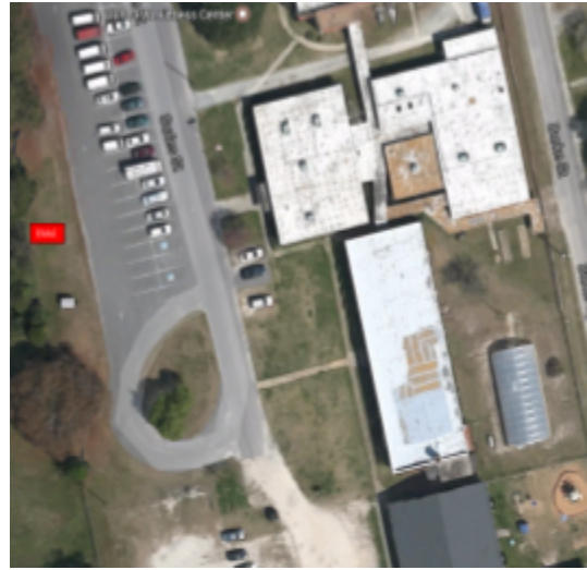
Dunn Center (0062, 0063, 0064)