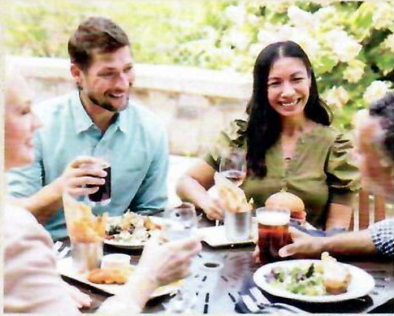
Antler Hill Village shopping and dining